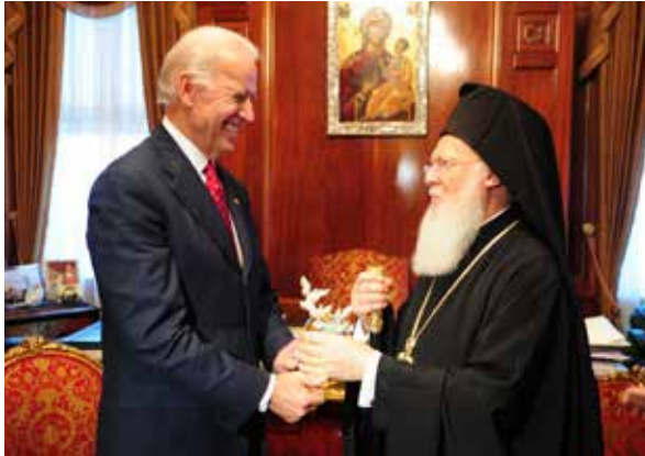
Ecumenical Patriarch welcoming Joe Biden to the Phanar.