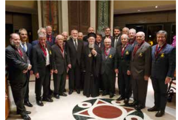
Archons with His All-Holiness during pilgrimage to Constantinople.