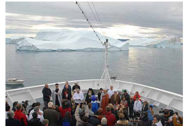
Prayers during an environmental symposium, "The Arctic: Mirror of Life" in Greenland.