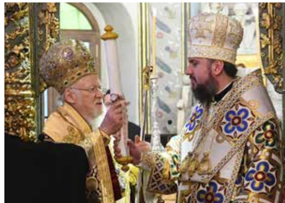
Granting the Tomos of Autocephaly to the Church of Ukraine.