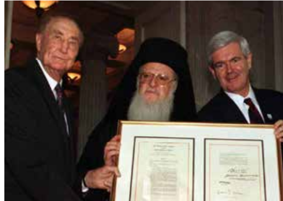
Recipient of the Congressional Gold Medal with record number of votes.