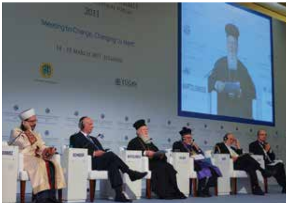
Participating in the International Summit of Leaders of Change in Istanbul.